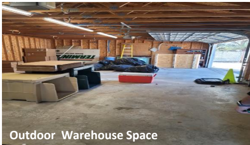
Outdoor Warehouse Space